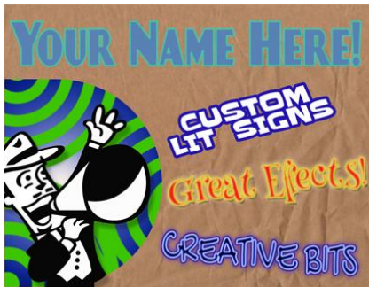
Example of user created translucent graphic overlay