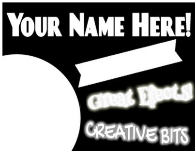
Example of user created transparent mask